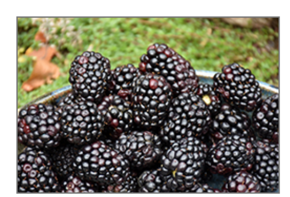
Triple Crown Blackberry fruit