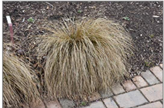
Prairie Fire Sedge

Prairie Fire Sedge is recommended for the following landscape applications;