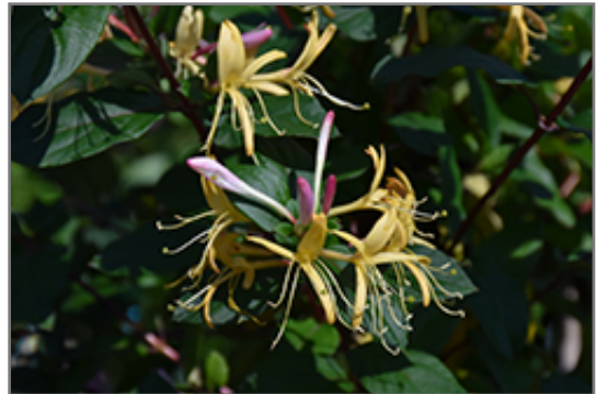
Purple-Leaf Japanese Honeysuckle flowers

Purple-Leaf Japanese Honeysuckle is an open multi-stemmed evergreen woody vine with a twining and trailing habit of growth. Its average texture blends into the landscape, but can be balanced by one or two finer or coarser trees or shrubs for an effective composition.