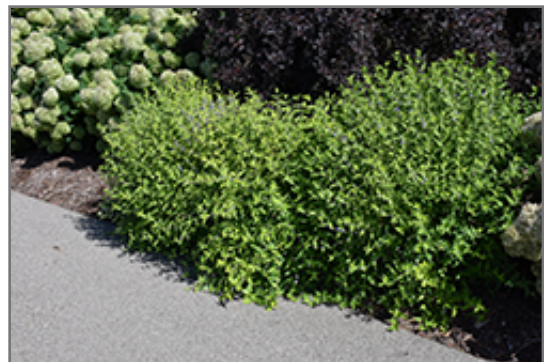
Sunshine Blue II Caryopteris in bloom