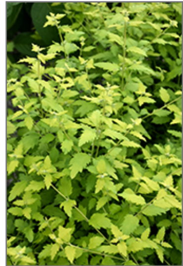
Sunshine Blue II Caryopteris foliage

* This is a 'special order' plant - contact store for details