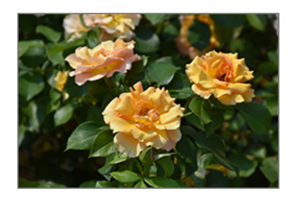
Tequila Supreme Rose flowers