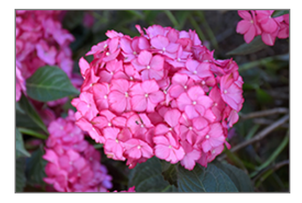
Seaside Serenade Hamptons Hydrangea flowers