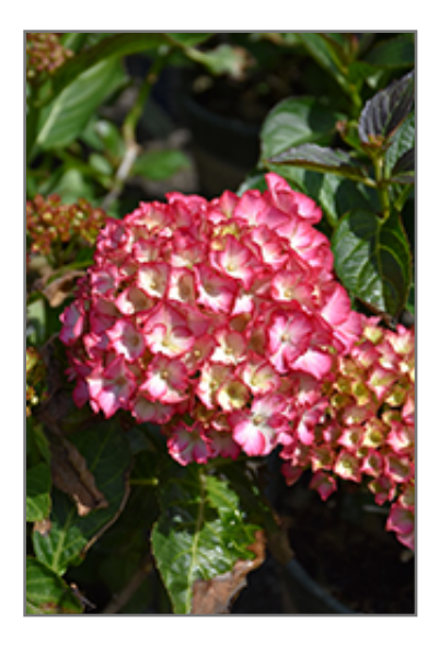
Seaside Serenade Hamptons Hydrangea flowers