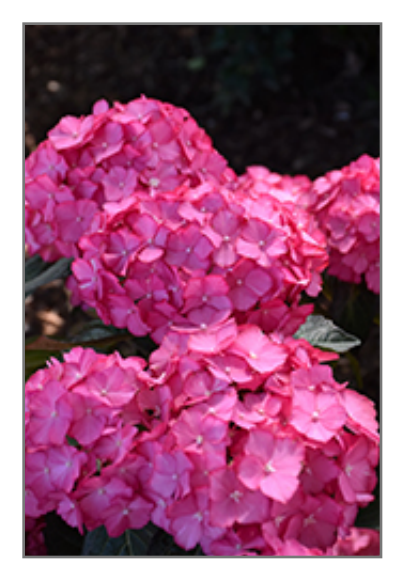
Seaside Serenade Hamptons Hydrangea flowers

This shrub will require occasional maintenance and upkeep, and should only be pruned after flowering to avoid removing any of the current season's flowers. It has no significant negative characteristics.