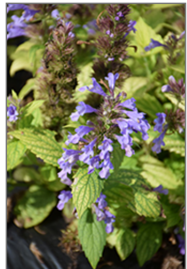
Prelude Blue Catmint flowers