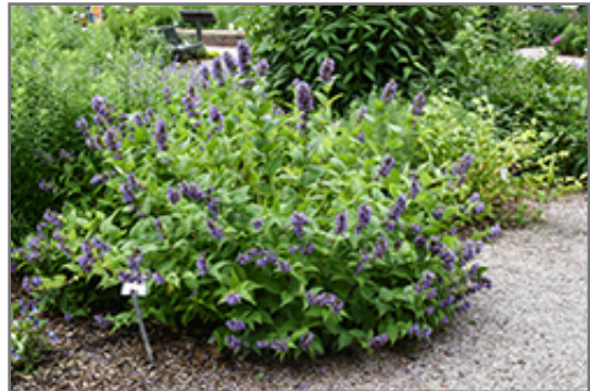
Prelude Blue Catmint in bloom