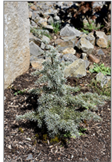
Glacier Peak Mountain Hemlock