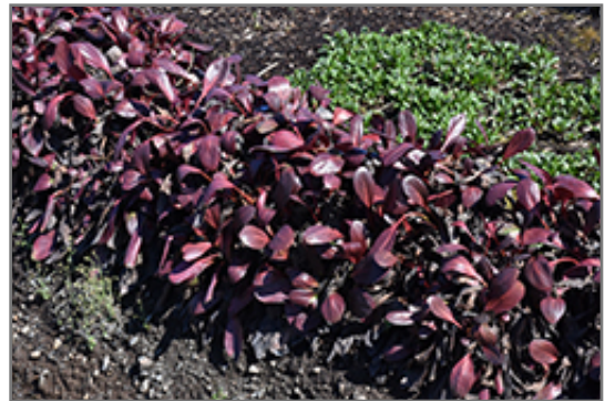
Flirt Bergenia foliage