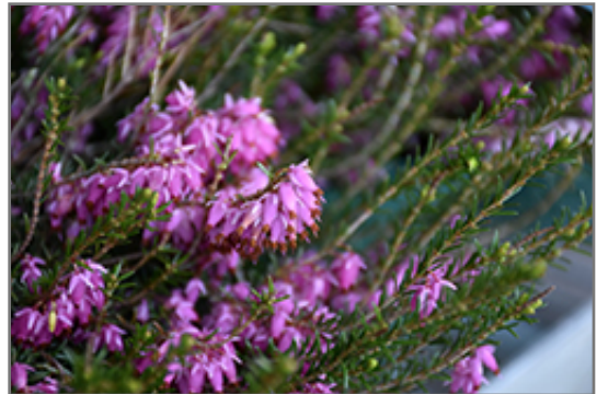
Pink Spangles Heath flowers

Pink Spangles Heath is recommended for the following landscape applications;