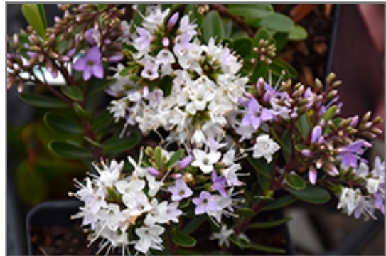
Patty's Purple Hebe flowers

Patty's Purple Hebe is recommended for the following landscape applications;