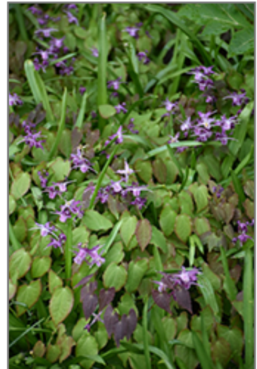
Dark Beauty Bishop's Hat flowers

Dark Beauty Bishop's Hat is a dense herbaceous evergreen perennial with a ground-hugging habit of growth. Its medium texture blends into the garden, but can always be balanced by a couple of finer or coarser plants for an effective composition.