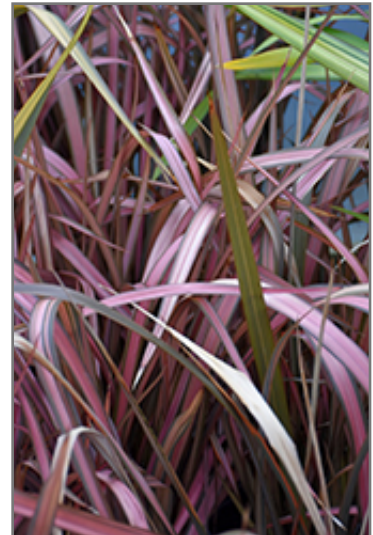
Pink Panther New Zealand Flax foliage

Pink Panther New Zealand Flax is recommended for the following landscape applications;