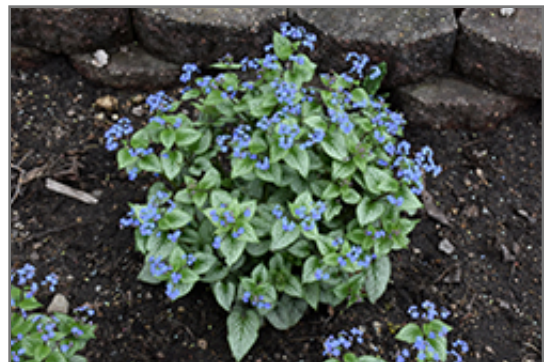
Sterling Silver Bugloss in bloom