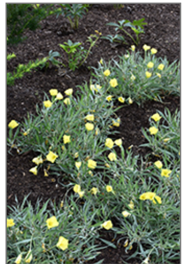
Evening Sun Primrose in bloom