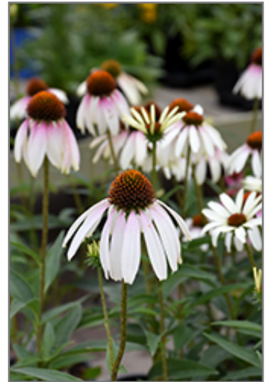
Pretty Parasols Coneflower flowers

Pretty Parasols Coneflower is recommended for the following landscape applications;