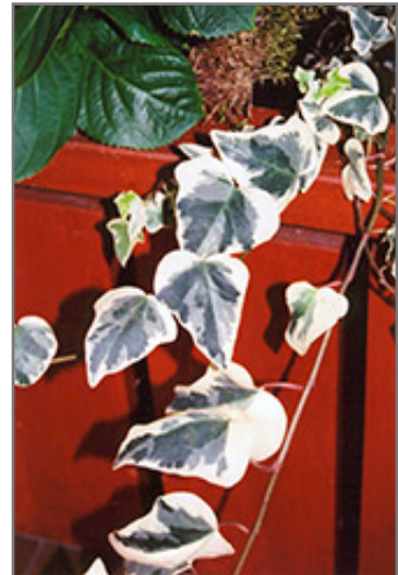
Variegated English Ivy foliage