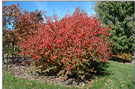
Korean Sun Pear in fall