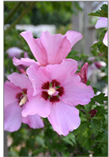
Rose Satin Rose of Sharon flowers

Rose Satin Rose of Sharon is recommended for the following landscape applications;