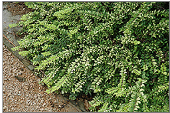
Edmee Gold Honeysuckle