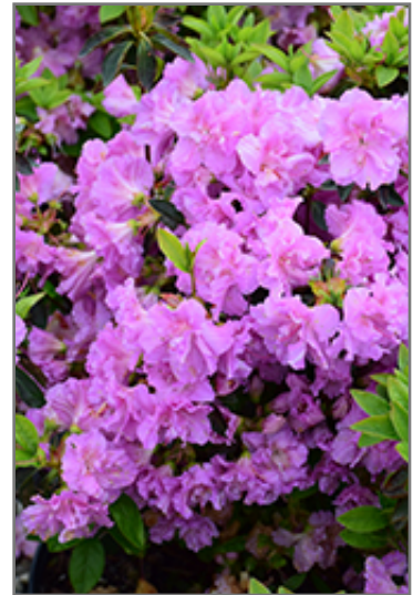
Elsie Lee Azalea flowers

Elsie Lee Azalea is recommended for the following landscape applications;