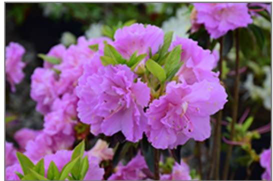
Elsie Lee Azalea flowers