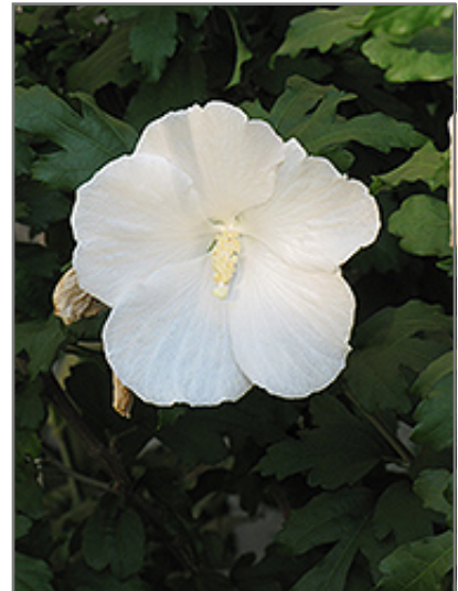
Diana Rose of Sharon flowers