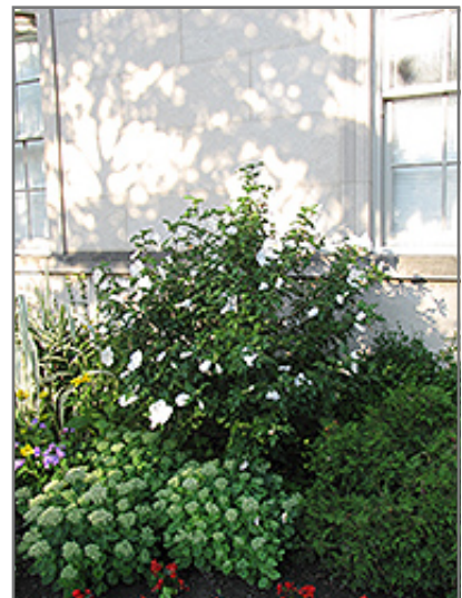
Diana Rose of Sharon in bloom