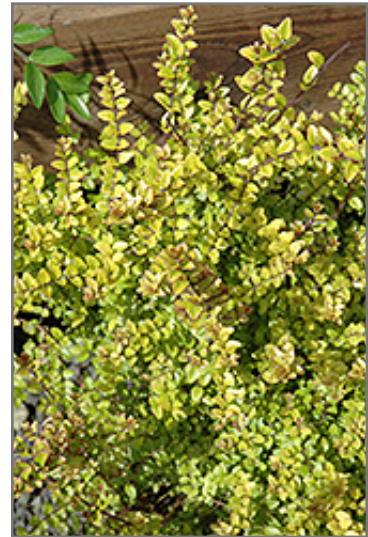
Baggesen's Gold Box Honeysuckle foliage