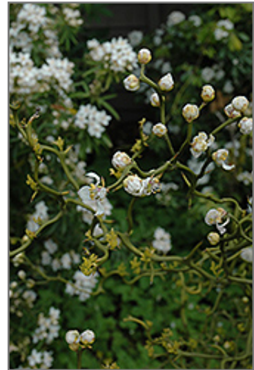
Flying Dragon Japanese Bitter Orange flowers

Flying Dragon Japanese Bitter Orange is a multi-stemmed deciduous shrub with an upright spreading habit of growth. Its average texture blends into the landscape, but can be balanced by one or two finer or coarser trees or shrubs for an effective composition.