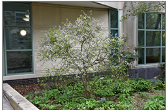
Flying Dragon Japanese Bitter Orange in bloom