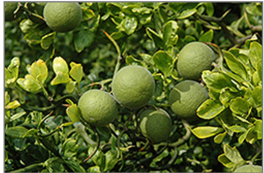
Flying Dragon Japanese Bitter Orange fruit

* This is a 'special order' plant - contact store for details