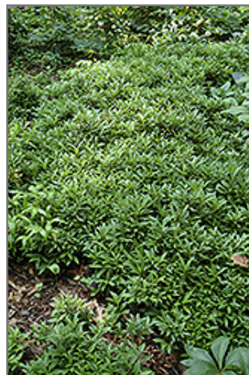
Dwarf Sweet Box

Dwarf Sweet Box is recommended for the following landscape applications;