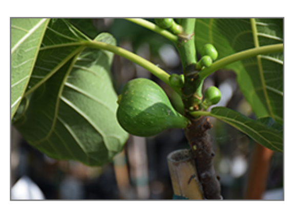
Peter's Honey Fig fruit

This is a multi-stemmed deciduous tree with a more or less rounded form. Its average texture blends into the landscape, but can be balanced by one or two finer or coarser trees or shrubs for an effective composition. This plant will require occasional maintenance and upkeep, and is best pruned in late winter once the threat of extreme cold has passed. It is a good choice for attracting birds to your yard, but is not particularly attractive to deer who tend to leave it alone in favor of tastier treats. It has no significant negative characteristics.