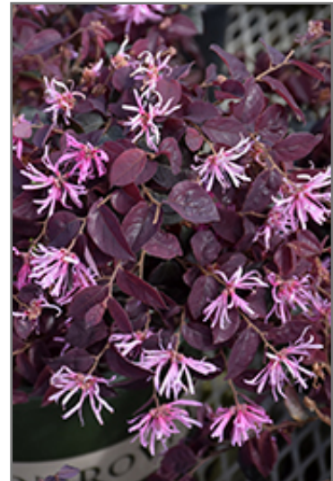
Sizzling Pink Chinese Fringeflower flowers