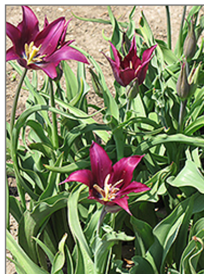
Purple Dream Tulip flowers