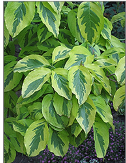
Cherokee Sunset Flowering Dogwood foliage