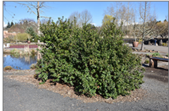
Red Escallonia

Red Escallonia will grow to be about 10 feet tall at maturity, with a spread of 10 feet. It tends to fill out right to the ground and therefore doesn't necessarily require facer plants in front, and is suitable for planting under power lines. It grows at a slow rate, and under ideal conditions can be expected to live for 40 years or more.