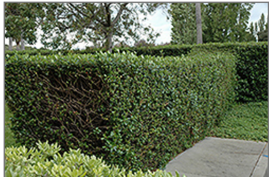
Red Escallonia