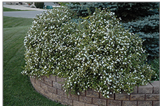
Abbotswood Potentilla in bloom