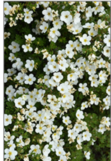
Abbotswood Potentilla flowers

Abbotswood Potentilla is recommended for the following landscape applications;