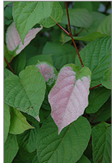
September Sun Kiwi foliage

September Sun Kiwi is a dense multi-stemmed deciduous woody vine with a twining and trailing habit of growth. Its average texture blends into the landscape, but can be balanced by one or two finer or coarser trees or shrubs for an effective composition.