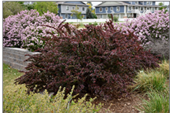
Red Leaf Japanese Barberry

This is a relatively low maintenance shrub, and can be pruned at anytime. Deer don't particularly care for this plant and will usually leave it alone in favor of tastier treats. Gardeners should be aware of the following characteristic(s) that may warrant special consideration;