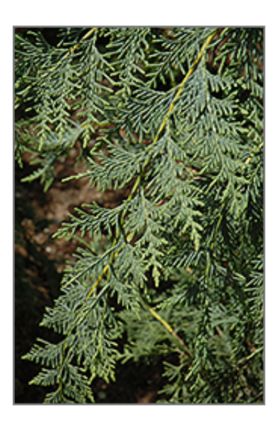
Naylor's Blue Leyland Cypress foliage