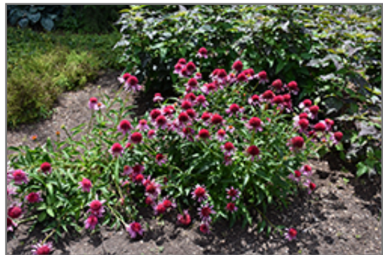
Double Scoop Bubble Gum Coneflower in bloom