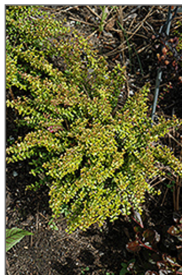
Twiggly Box Honeysuckle