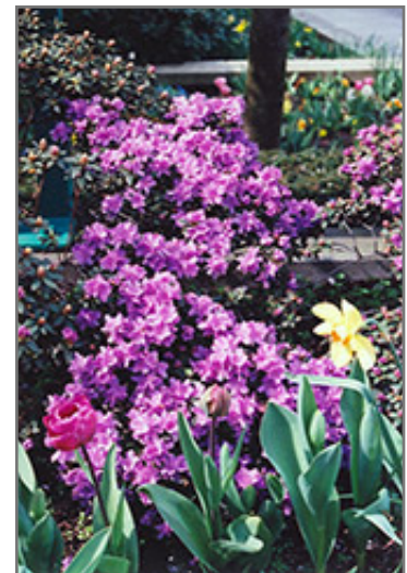
Ramapo Rhododendron in bloom