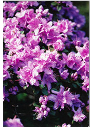
Ramapo Rhododendron flowers