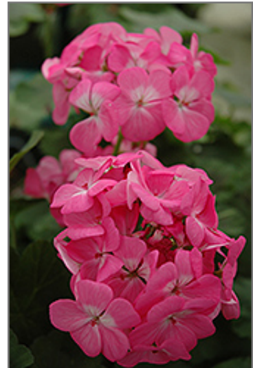
Pillar Pink Geranium flowers