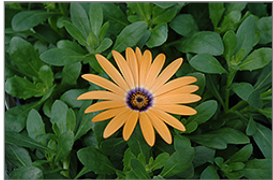
Orange Symphony African Daisy flowers