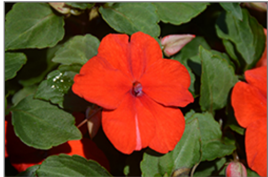
Super Elfin XP Scarlet Impatiens flowers

Super Elfin XP Scarlet Impatiens is recommended for the following landscape applications;