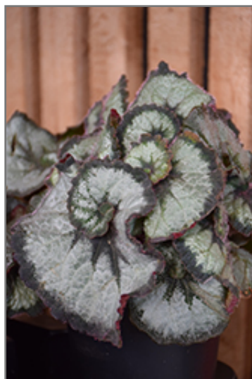
Escargot Begonia foliage