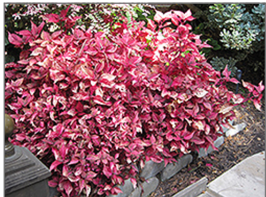
Blood Leaf