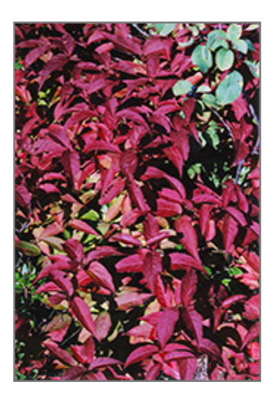
Bush Honeysuckle in fall