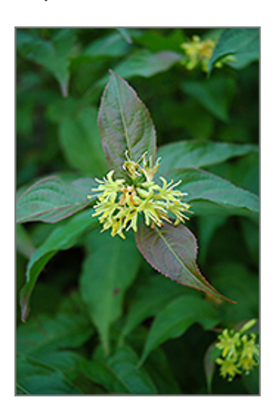
Bush Honeysuckle flowers