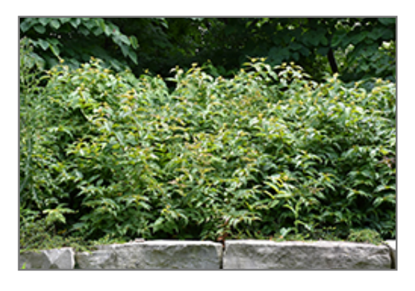
Bush Honeysuckle