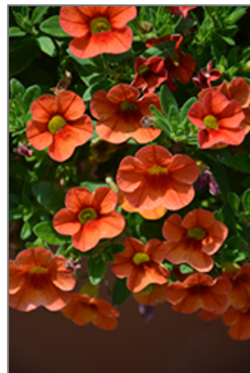
Aloha Hot Orange Calibrachoa flowers