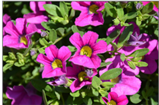
Million Bells Trailing Pink Calibrachoa flowers

Million Bells Trailing Pink Calibrachoa is recommended for the following landscape applications;