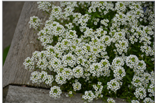
Snow Princess Alyssum flowers

Snow Princess Alyssum is recommended for the following landscape applications;