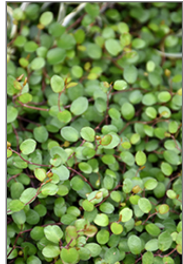
Creeping Wire Vine foliage