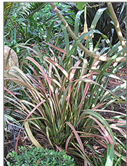
Jester New Zealand Flax