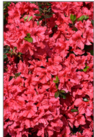
Johanna Azalea flowers