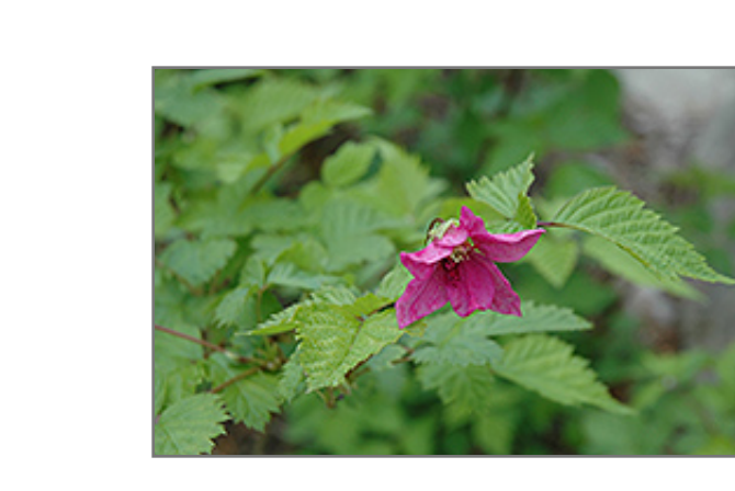
Salmonberry flowers

Salmonberry will grow to be about 6 feet tall at maturity, with a spread of 6 feet. It tends to be a little leggy, with a typical clearance of 2 feet from the ground, and is suitable for planting under power lines. It grows at a fast rate, and under ideal conditions can be expected to live for approximately 20 years.